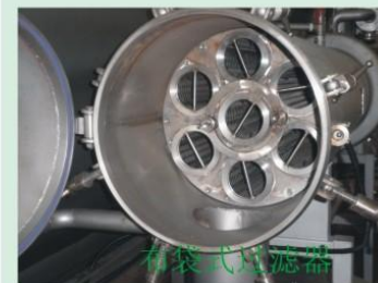
布袋式过滤器 The cloth bag filter