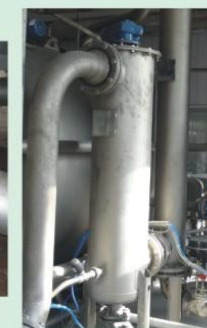
自清洁过滤器 Self-cleaning filter