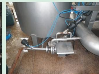
比例加料阀 Proportion of charging valve