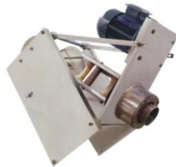
退捻装置 Untwisting device